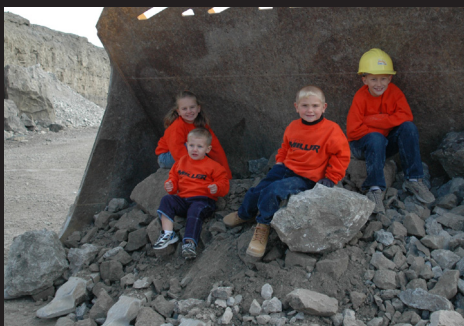
For Your Family

When you join our team, you'll be part of building that foundation.