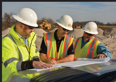
For Your Career